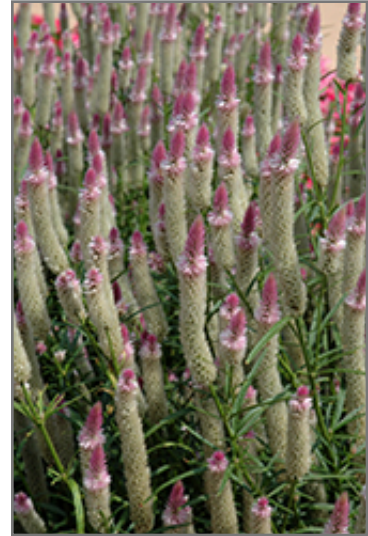
Flamingo Feather Celosia foliage