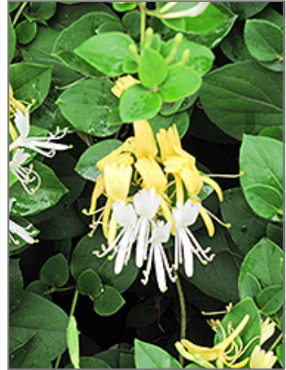
Hall's Japanese Honeysuckle flowers