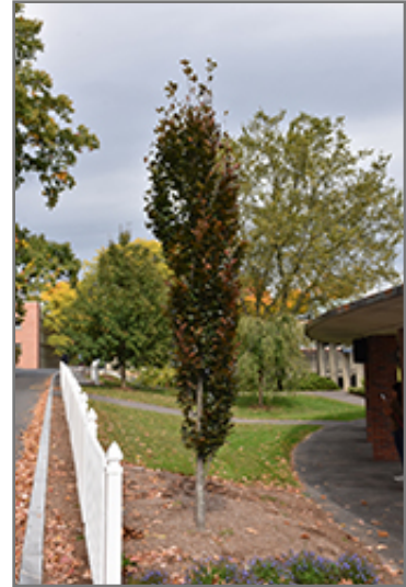
Dawyck Purple Beech