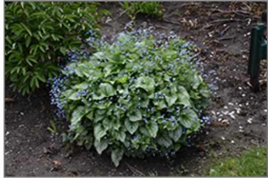
Sea Heart Bugloss in bloom

Sea Heart Bugloss is a fine choice for the garden, but it is also a good selection for planting in outdoor pots and containers. It is often used as a 'filler' in the 'spiller-thriller-filler' container combination, providing a mass of flowers and foliage against which the thriller plants stand out. Note that when growing plants in outdoor containers and baskets, they may require more frequent waterings than they would in the yard or garden.