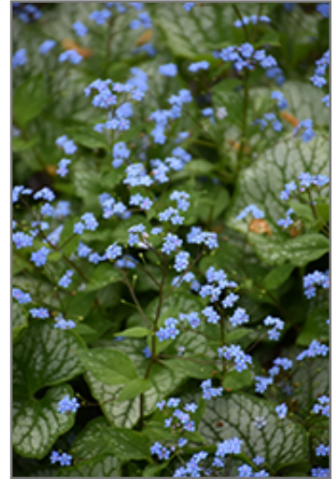
Sea Heart Bugloss flowers