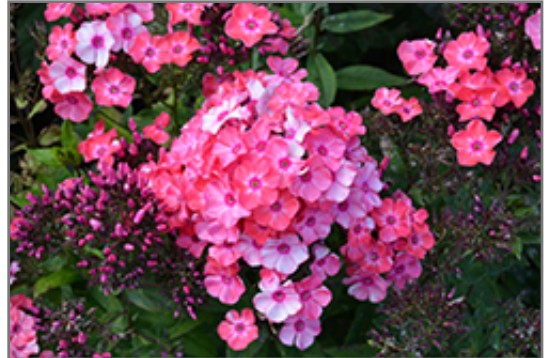
Garden Girls Glamour Girl Garden Phlox flowers