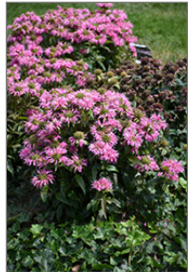
Pardon My Pink Beebalm in bloom