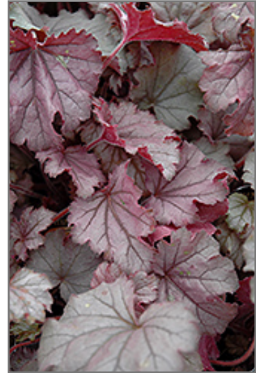
Little Cuties Sugar Berry Coral Bells foliage

Little Cuties Sugar Berry Coral Bells is recommended for the following landscape applications;