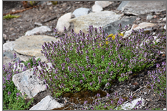
Lemon Thyme in bloom

This plant is quite ornamental as well as edible, and is as much at home in a landscape or flower garden as it is in a designated herb garden. It should only be grown in full sunlight. It prefers to grow in average to dry locations, and dislikes excessive moisture. It is considered to be drought-tolerant, and thus makes an ideal choice for a low-water garden or xeriscape application. It is not particular as to soil type or pH. It is highly tolerant of urban pollution and will even thrive in inner city environments. Consider covering it with a thick layer of mulch in winter to protect it in exposed locations or colder microclimates. This particular variety is an interspecific hybrid. It can be propagated by division; however, as a cultivated variety, be aware that it may be subject to certain restrictions or prohibitions on propagation.