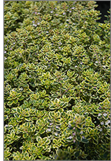
Lemon Thyme foliage

Lemon Thyme is smothered in stunning spikes of lilac purple flowers rising above the foliage from early to late summer. Its attractive tiny fragrant round leaves remain light green in color throughout the year.