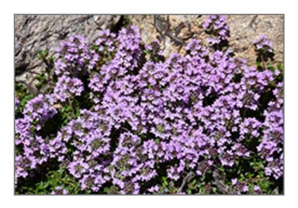
Purple Carpet Creeping Thyme flowers