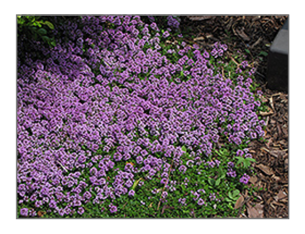
Purple Carpet Creeping Thyme in bloom