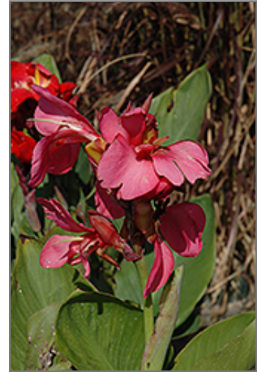
Tropical Rose Canna flowers

This plant should only be grown in full sunlight. It requires an evenly moist well-drained soil for optimal growth, but will die in standing water. It is not particular as to soil pH, but grows best in rich soils. It is highly tolerant of urban pollution and will even thrive in inner city environments, and will benefit from being planted in a relatively sheltered location. Consider applying a thick mulch around the root zone in winter to protect it in exposed locations or colder microclimates. This particular variety is an interspecific hybrid. It can be propagated by division; however, as a cultivated variety, be aware that it may be subject to certain restrictions or prohibitions on propagation.