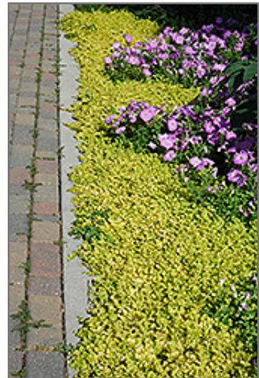
Golden Creeping Jenny