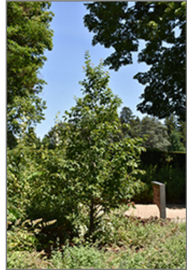
Firespire American Hornbeam

This tree performs well in both full sun and full shade. It is an amazingly adaptable plant, tolerating both dry conditions and even some standing water. It is not particular as to soil type or pH. It is somewhat tolerant of urban pollution. This is a selection of a native North American species.