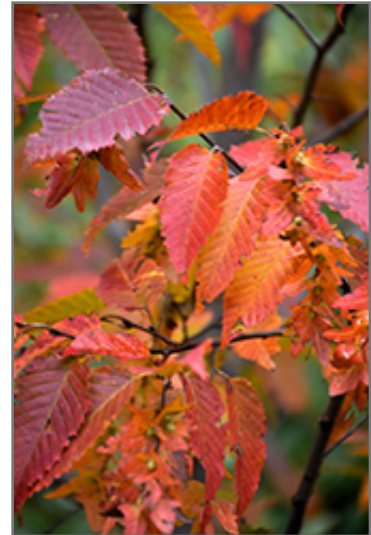
Firespire American Hornbeam in fall