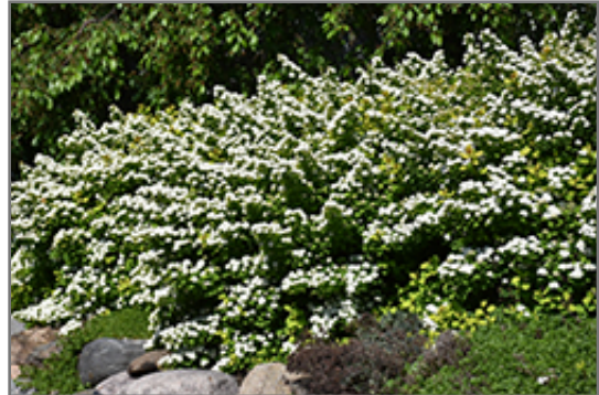
Glow Girl Birch Leaf Spirea in bloom