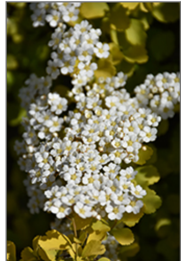
Glow Girl Birch Leaf Spirea flowers