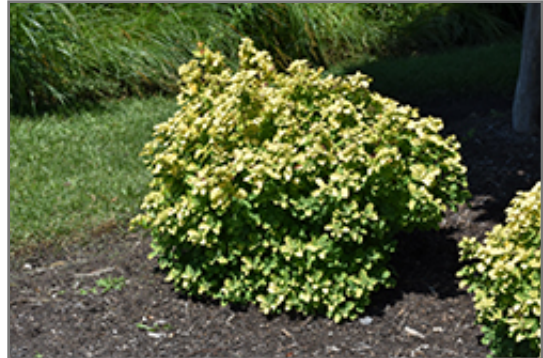
Glow Girl Birch Leaf Spirea