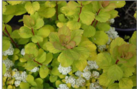
Glow Girl Birch Leaf Spirea foliage

This shrub should only be grown in full sunlight. It prefers to grow in average to moist conditions, and shouldn't be allowed to dry out. It is not particular as to soil type or pH. It is highly tolerant of urban pollution and will even thrive in inner city environments. This is a selected variety of a species not originally from North America.