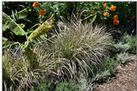
Cherry Sparkler Fountain Grass