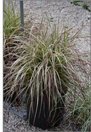
Cherry Sparkler Fountain Grass foliage

Cherry Sparkler Fountain Grass is a fine choice for the garden, but it is also a good selection for planting in outdoor pots and containers. It can be used either as 'filler' or as a 'thriller' in the 'spiller-thriller-filler' container combination, depending on the height and form of the other plants used in the container planting. It is even sizeable enough that it can be grown alone in a suitable container. Note that when growing plants in outdoor containers and baskets, they may require more frequent waterings than they would in the yard or garden.