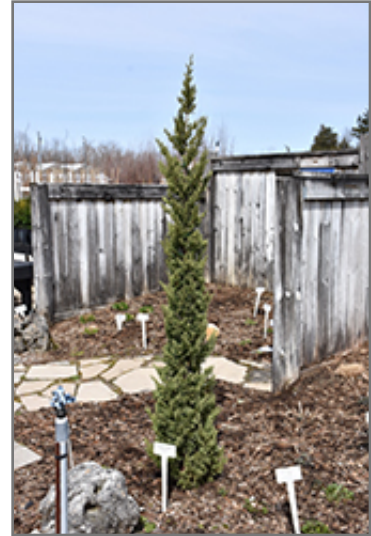
Trautman Juniper

This shrub should only be grown in full sunlight. It is very adaptable to both dry and moist growing conditions, but will not tolerate any standing water. It is not particular as to soil type or pH. It is highly tolerant of urban pollution and will even thrive in inner city environments. This is a selected variety of a species not originally from North America.