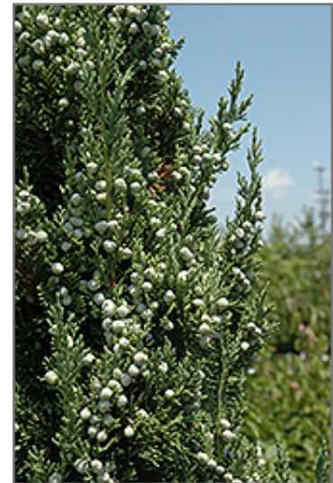
Trautman Juniper fruit