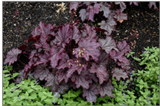
Spellbound Coral Bells