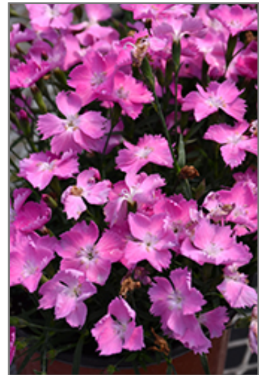
Beauties Kahori Pink Pinks flowers