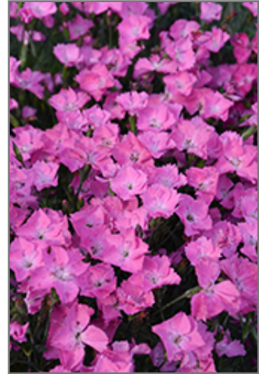
Beauties Kahori Pink Pinks flowers

Beauties Kahori Pink Pinks is recommended for the following landscape applications;