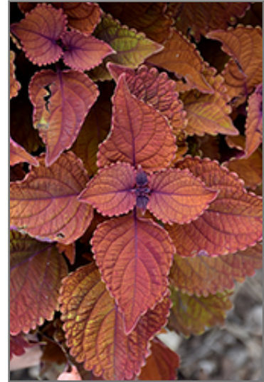
Wall Street Coleus foliage