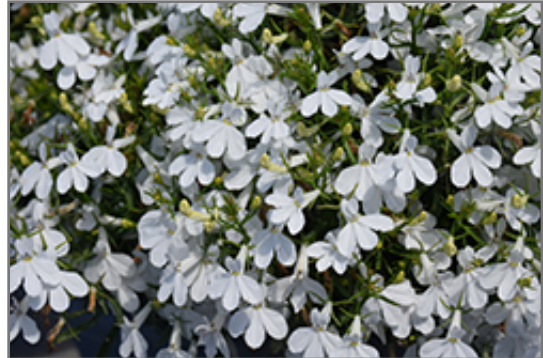
Techno Upright White Lobelia flowers

Techno Upright White Lobelia is recommended for the following landscape applications;