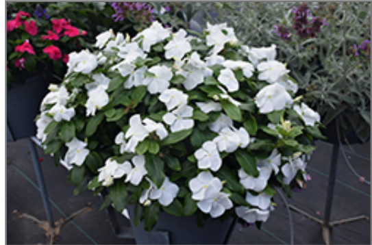
Titan Pure White Vinca in bloom

Titan Pure White Vinca is a fine choice for the garden, but it is also a good selection for planting in outdoor containers and hanging baskets. It is often used as a 'filler' in the 'spiller-thriller-filler' container combination, providing a mass of flowers against which the thriller plants stand out. Note that when growing plants in outdoor containers and baskets, they may require more frequent waterings than they would in the yard or garden.