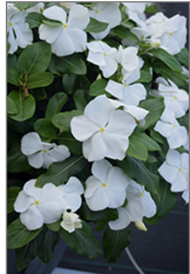
Titan Pure White Vinca flowers

Titan Pure White Vinca is recommended for the following landscape applications;