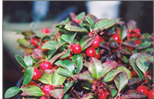
Creeping Wintergreen fruit