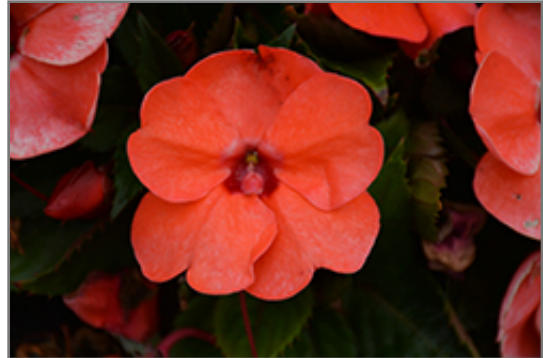
SunPatiens Compact Hot Coral New Guinea Impatiens flowers

SunPatiens Compact Hot Coral New Guinea Impatiens is recommended for the following landscape applications;