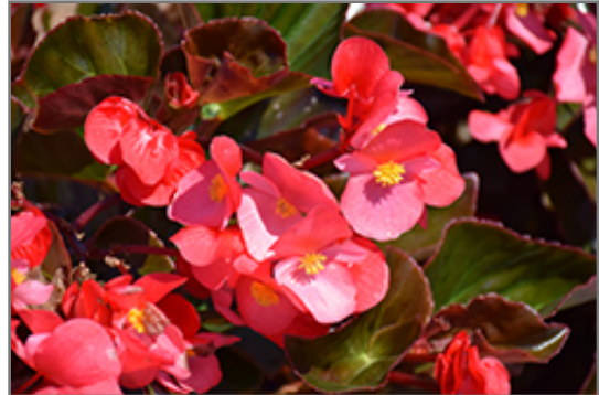
Whopper Rose Bronze Leaf Begonia flowers

Whopper Rose Bronze Leaf Begonia is recommended for the following landscape applications;