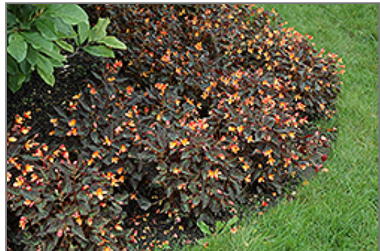
Sparks Will Fly Begonia in bloom