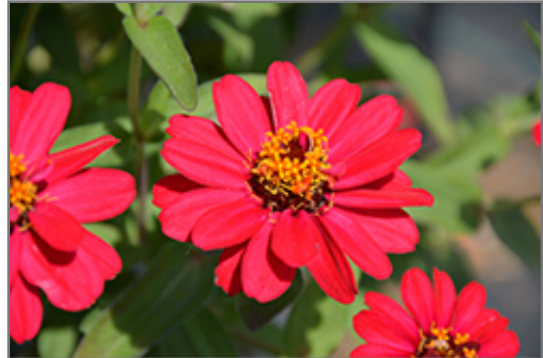
Profusion Double Hot Cherry Zinnia flowers