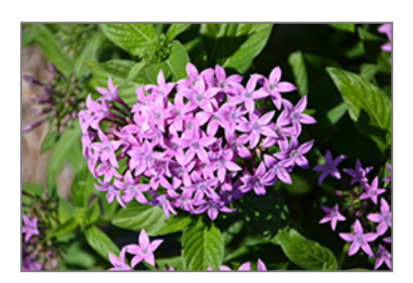
Graffiti OG Lavender Star Flower flowers