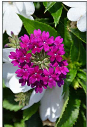
Superbena Royale Plum Wine Verbena flowers