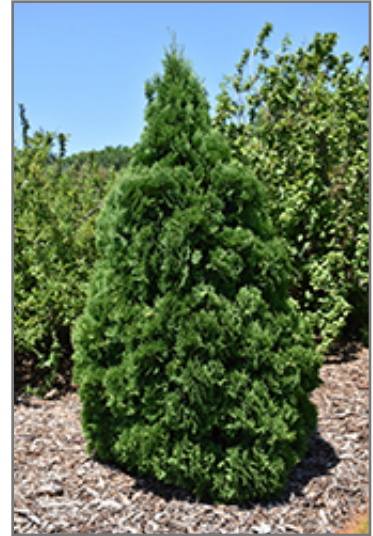
Holmstrup Arborvitae flowers

Holmstrup Arborvitae will grow to be about 10 feet tall at maturity, with a spread of 5 feet. It tends to fill out right to the ground and therefore doesn't necessarily require facer plants in front, and is suitable for planting under power lines. It grows at a slow rate, and under ideal conditions can be expected to live for approximately 30 years.