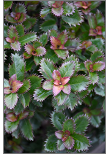
Sallywag Holly foliage