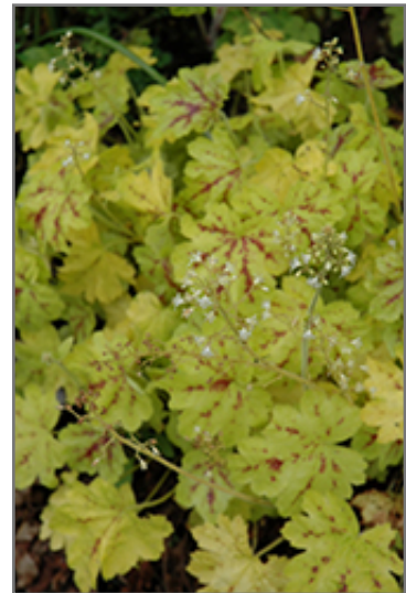
Solar Power Foamy Bells flowers