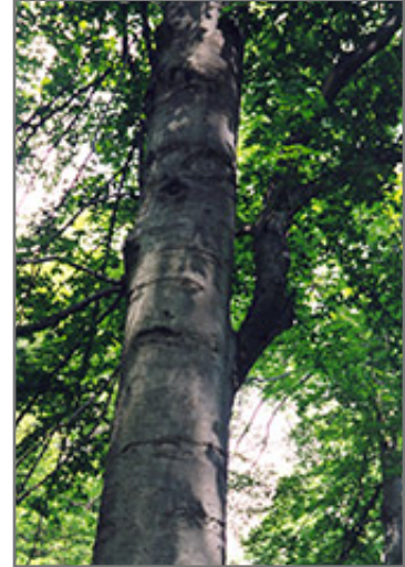
American Beech bark

This tree should only be grown in full sunlight. It requires an evenly moist well-drained soil for optimal growth, but will die in standing water. It is not particular as to soil pH, but grows best in rich soils. It is quite intolerant of urban pollution, therefore inner city or urban streetside plantings are best avoided, and will benefit from being planted in a relatively sheltered location. This species is native to parts of North America.