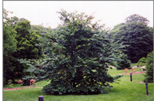
American Beech