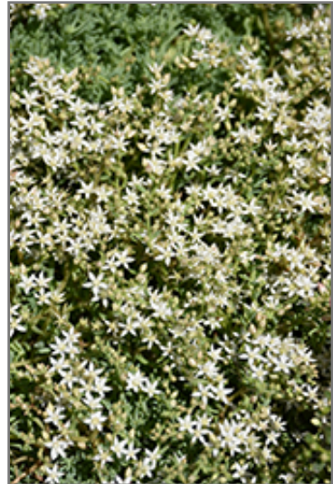
Dwarf Spanish Stonecrop flowers