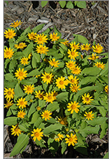
Million Gold Melampodium flowers