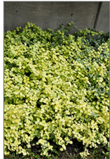
Lemon Licorice Plant