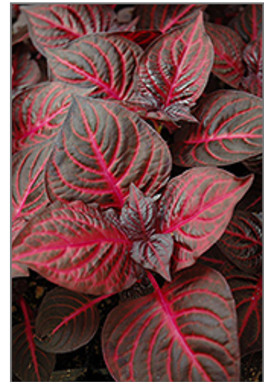
Blazin' Rose Blood Leaf foliage