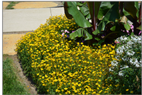
Goldilocks Rocks Bidens in bloom