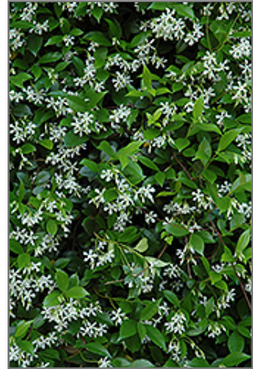
Confederate Star-Jasmine flowers