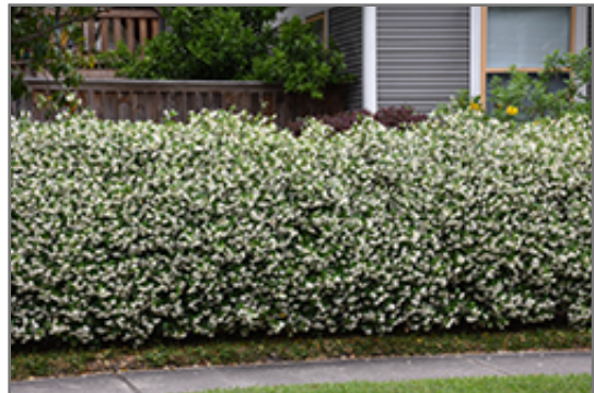
Confederate Star-Jasmine in bloom