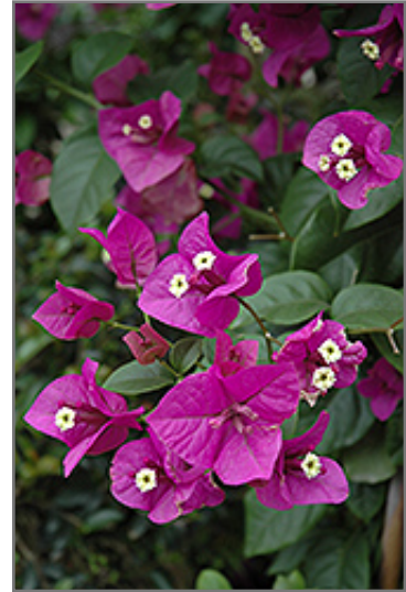
Purple Queen Bougainvillea flowers