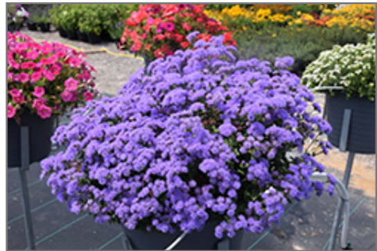
Artist Blue Flossflower in bloom