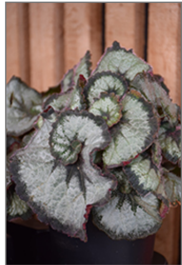
Escargot Begonia foliage