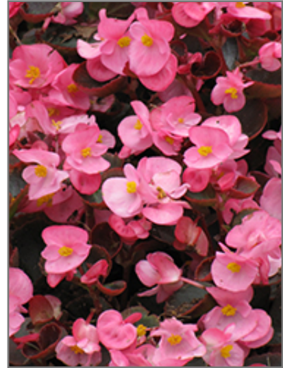
Bada Boom Pink Begonia flowers

Bada Boom Pink Begonia is recommended for the following landscape applications;