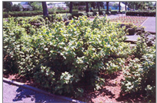
Consort Black Currant