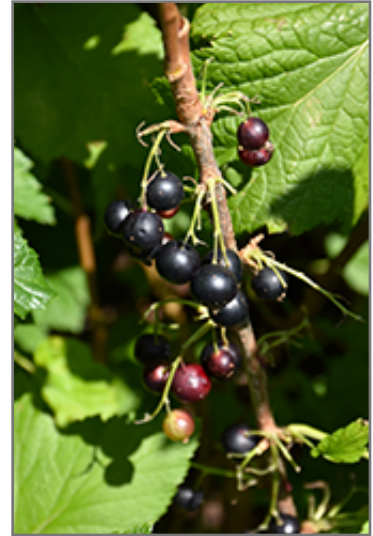
Consort Black Currant fruit

Aside from its primary use as an edible, Consort Black Currant is suitable for the following landscape applications;