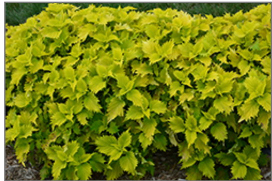
Wasabi Coleus