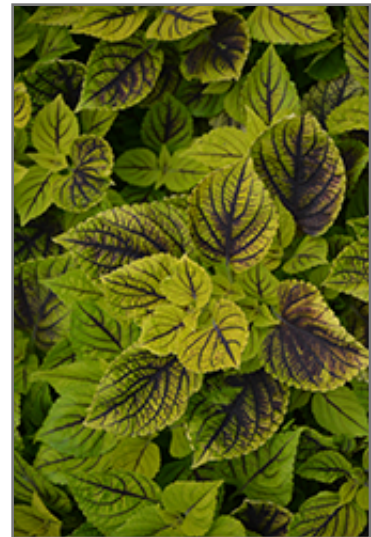
Gays Delight Coleus foliage