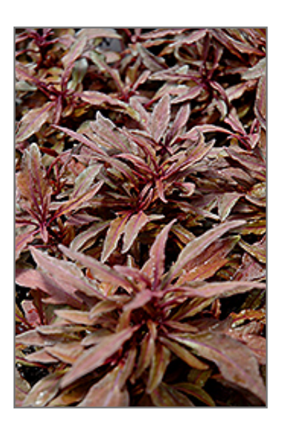
ColorBlaze Velvet Mocha Coleus foliage

ColorBlaze Velvet Mocha Coleus will grow to be about 3 feet tall at maturity, with a spread of 24 inches. When grown in masses or used as a bedding plant, individual plants should be spaced approximately 20 inches apart. Although it's not a true annual, this fast-growing plant can be expected to behave as an annual in our climate if left outdoors over the winter, usually needing replacement the following year. As such, gardeners should take into consideration that it will perform differently than it would in its native habitat.