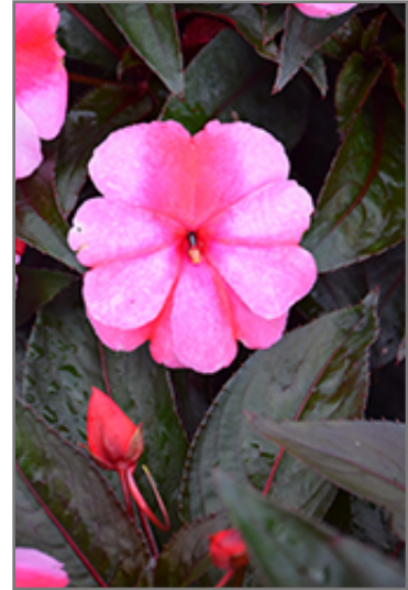
Super Sonic Sweet Cherry New Guinea Impatiens flowers

Super Sonic Sweet Cherry New Guinea Impatiens is recommended for the following landscape applications;