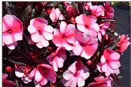
Super Sonic Sweet Cherry New Guinea Impatiens flowers