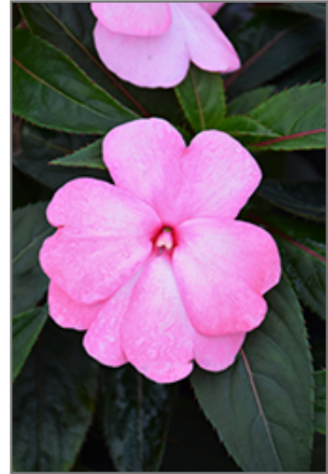
Super Sonic Pastel Pink New Guinea Impatiens flowers