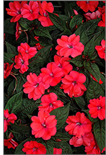
SunPatiens Compact Deep Rose New Guinea Impatiens flowers

SunPatiens Compact Deep Rose New Guinea Impatiens is recommended for the following landscape applications;