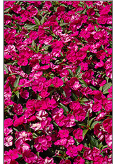
Fanfare Fuchsia Impatiens flowers