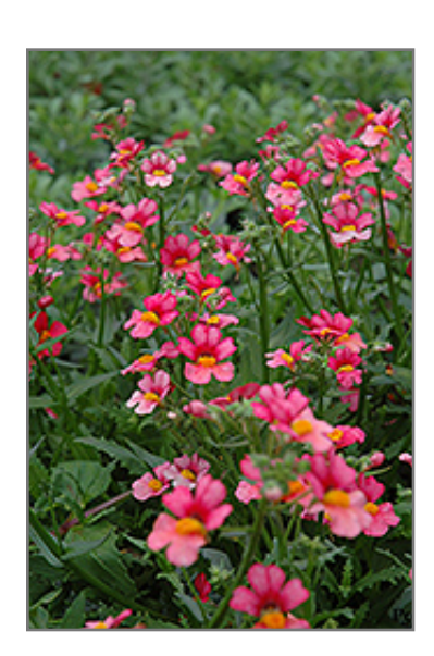
Juicy Fruits Watermelon Nemesia flowers

Juicy Fruits Watermelon Nemesia will grow to be about 12 inches tall at maturity, with a spread of 10 inches. When grown in masses or used as a bedding plant, individual plants should be spaced approximately 6 inches apart. Its foliage tends to remain dense right to the ground, not requiring facer plants in front. This fast-growing annual will normally live for one full growing season, needing replacement the following year.